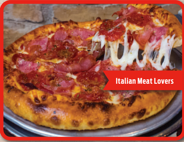
Italian Meat Lovers

Alfredo sauce, mozzarella, fresh baby spinach and charbroiled chicken breast.