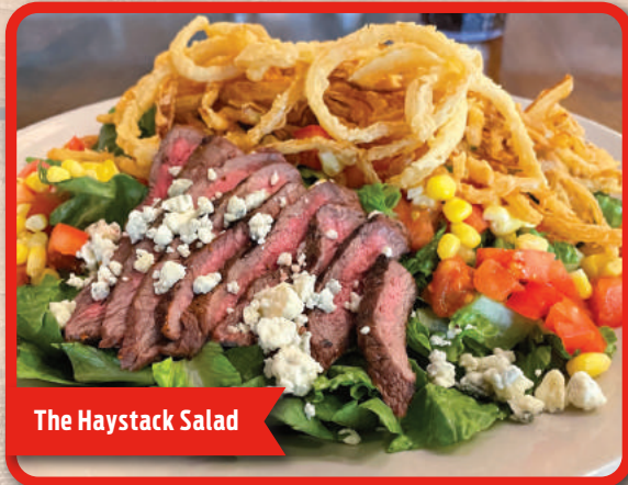
The Haystack Salad

Haystack Salad 15 Mixed greens, sirloin steak, bleu cheese crumbles, kernel corn, tomatoes, and crispy onion strings. Your choice of dressing.