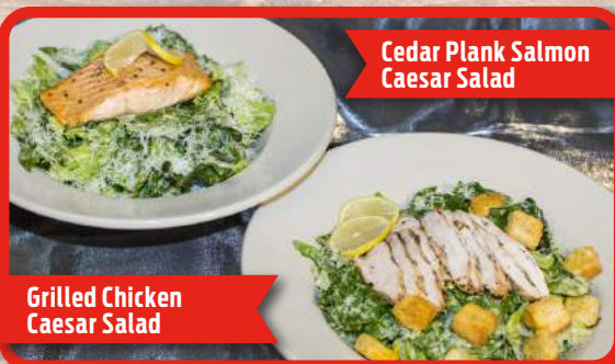
Cedar Plank Salmon Caesar Salad

Bowl of Soup 7 Choose from Creamy Potato Soup or Chicken Tortilla Soup.