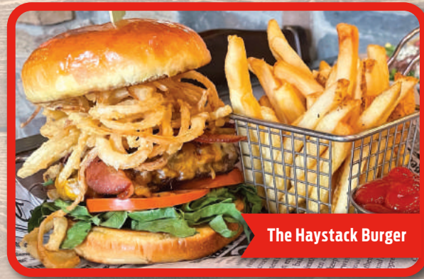
The Haystack Burger

Fire roasted pineapple, shaved ham, pepper jack cheese, lettuce and tomato.