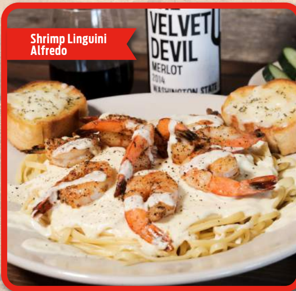
Shrimp Linguini Alfredo

House or Caesar side salad or bowl of soup 3.00 with any meal.