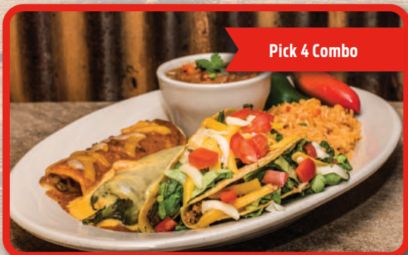
Pick 4 Combo

Two taco meat enchiladas with red sauce and 2 fried eggs.